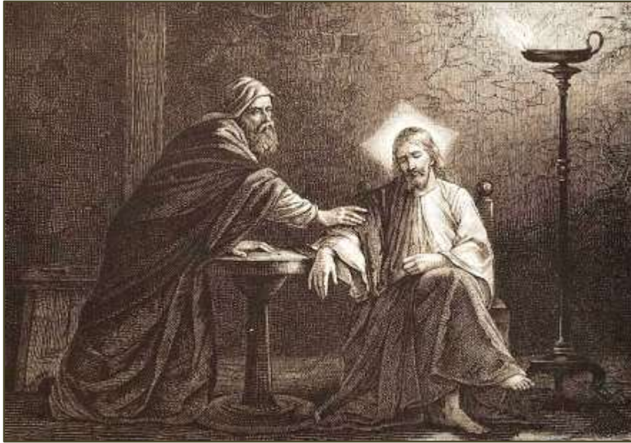
“Nicodemus Seeks Jesus by Night” by Alexandre Bida, 1875.