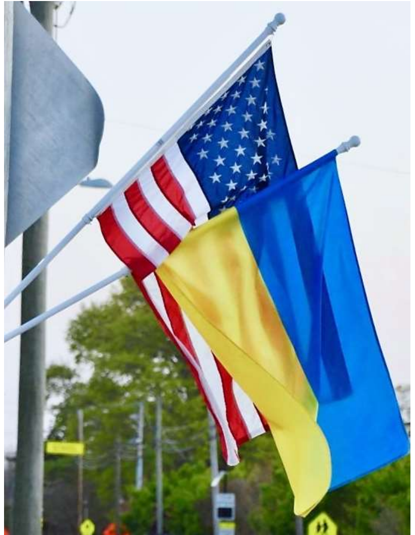
ABOVE LEFT: The setting sun bathes one of Groome Church's stained-glass windows in light. The historic church was founded in 1904. RIGHT: Groome Church is in the process of collecting donations to support war victims in Ukraine.

For more information, call 302-645-6256 or email gum1@hotmail.com .